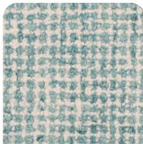
5 UNIQUE VISION