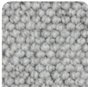
3 GREY MIST