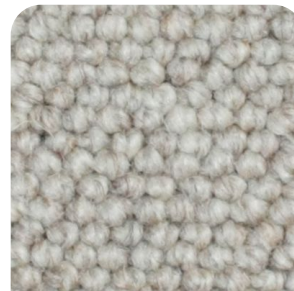
4 CASUAL BEIGE